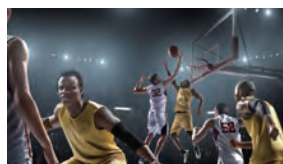
Original Image No Zoom

The ultra high quality imagery begins with a precision 12x F1.2–3.5 optical zoom lens (35mm equivalent: 29.6–355mm). When shooting in the HD mode, Dynamic Zoom combines optical zoom and pixel mapping from a 4K image sensor to create seamless and lossless 24x zoom. This allows the camera to have a long zoom range while retaining its compact form factor.