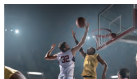
12x Optical Zoom