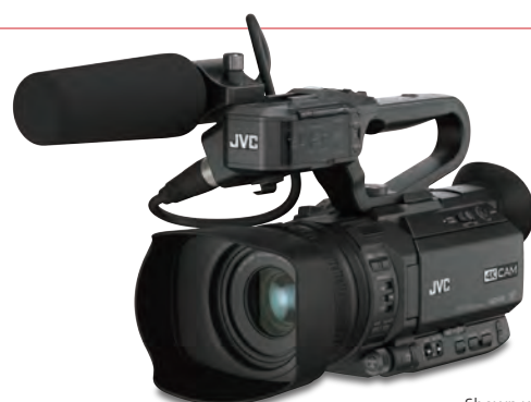
Shown with optional microphone