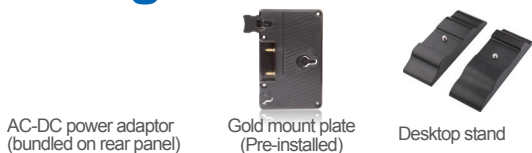
AC-DC power adaptor (bundled on rear panel)