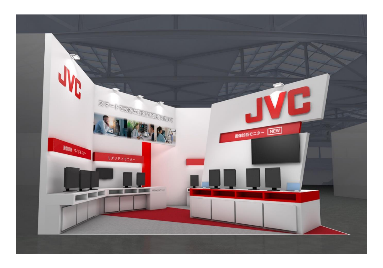
Conceptual image of JVCKENWOOD booth

Under the theme of "Toward a Smart and Comfortable Diagnostic Imaging Environment," the JVCKENWOOD booth will feature a full lineup of medical image display monitors, mainly the "i3 Series," and introduce software and services that can be linked to its display monitor products.